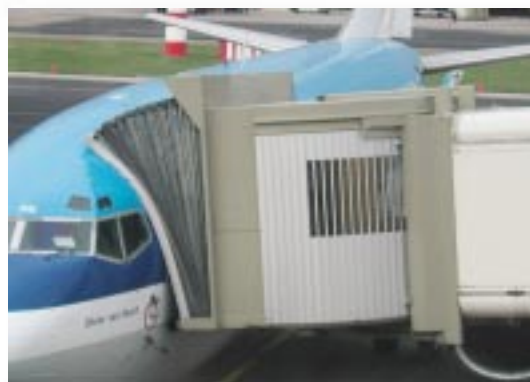
Passengers transit is visible both during day and night.