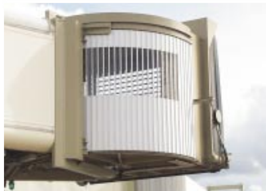
Traditional models show rusty areas and damages that make them not to be perfectly transparent.